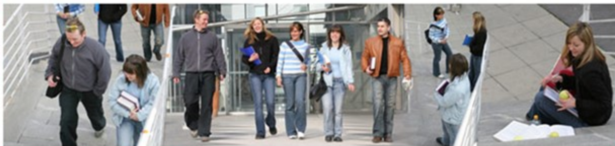
Climbing the steps to success