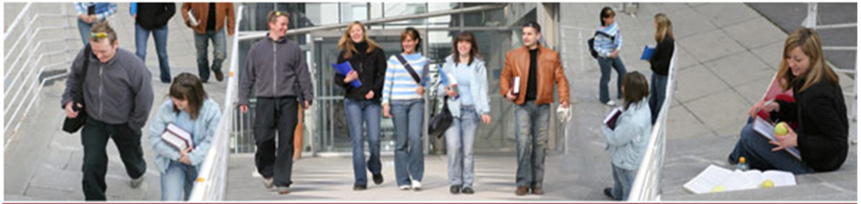
Climbing the steps to success