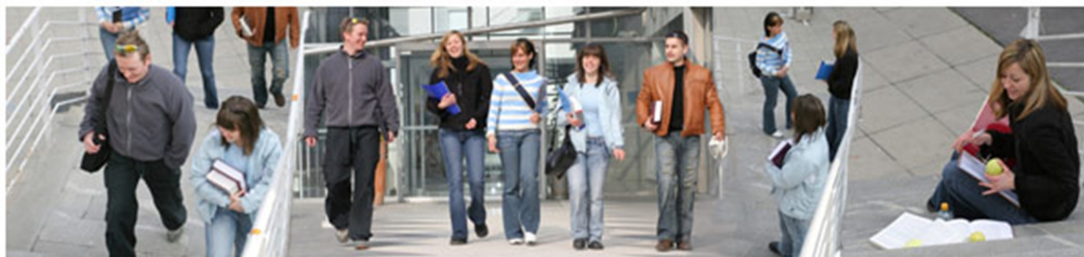
Climbing the steps to success